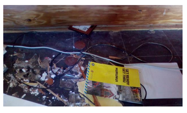
Figure 44: Trapped picture frame under sill log

These large movements caused massive non-structural damage, as expected. Some typical downstairs damage is shown in Figures 53 and 54, and in Figure 55 which shows the kitchen and the hot water cylinder. Damage in the upper storey was much less, as shown in Figure 56.