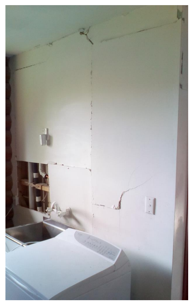
Figure 36: Typical cracking of gypsum plasterboard