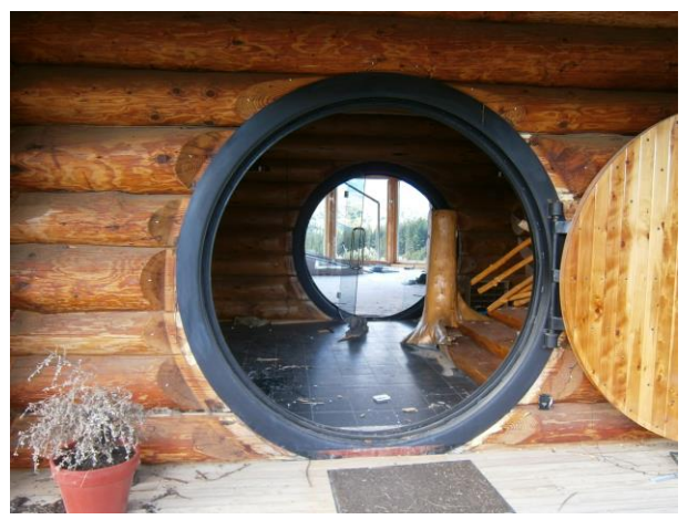
Figure 43: Large deformation around very stiff circular door frame

Permanent deformations from horizontal sliding between logs was much larger in this house than in houses at Mt Lyford, as shown in Figures 41 and 42. There was unusual movement around the circular steel frame of the front door shown in Figure 43 where there was upwards movement of logs due to the shape of the door frame. The picture trapped under the bottom log in Figure 44 shows that there was significant vertical movement of some log walls.