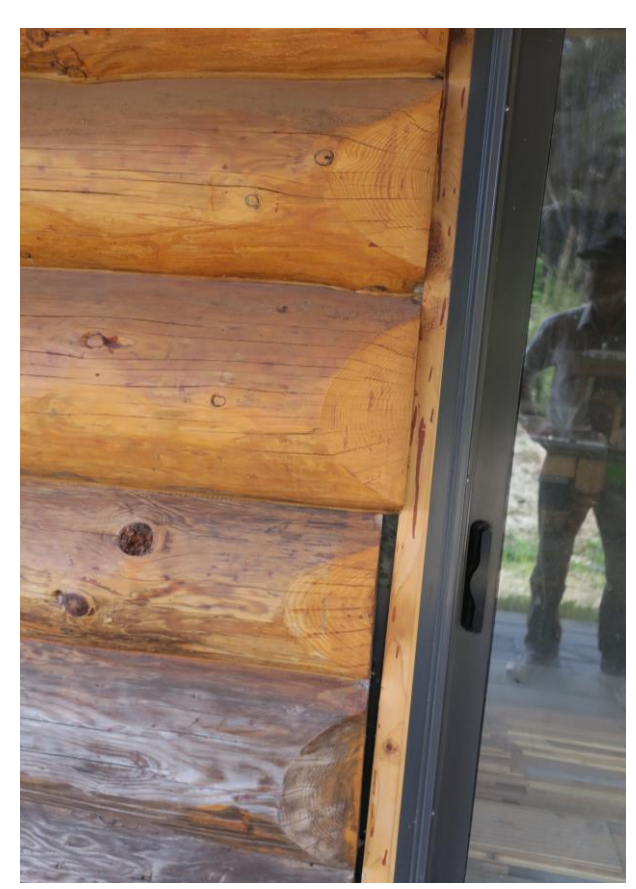
Figure 18: Localized sliding of logs