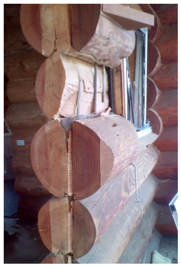
Figure 52: Splitting of log due to weakening by dowels, tie rod and vertical slot at door frame