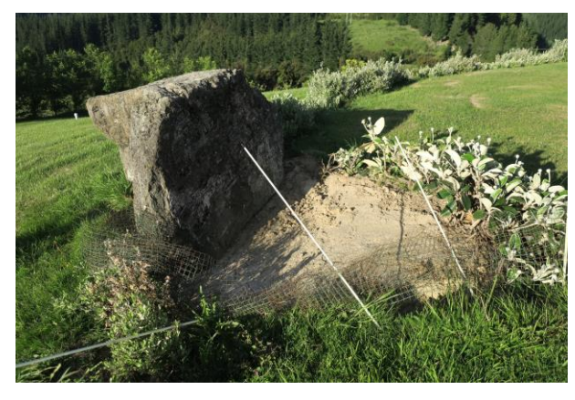
Figure 40: The rock close to the house was moved by about a meter by the earthquake