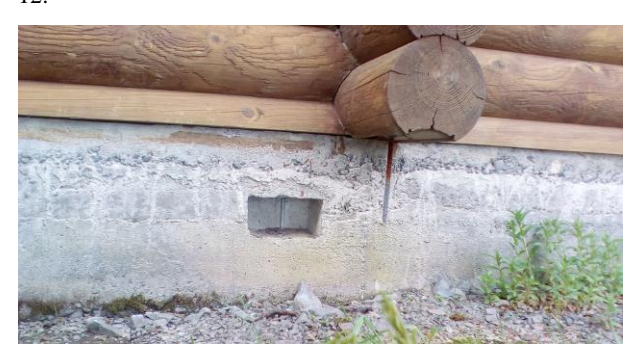
Figure 12: Typical connection details with vertical steel rods and anchorage into foundation and half log (sill log)

Structural design methods for most log houses are described briefly, as an introduction to the observations of earthquake damage. All walls are constructed with horizontal logs stacked on top of each other, with half-depth notches at the house corners to allow the logs to pass though the corner junction. This requires the bottom logs to be whole logs in one direction and half logs in the perpendicular direction as shown in Figure 12.