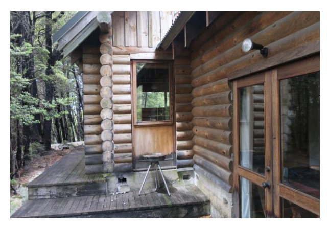
Figure 6: Two storey log house with slab on grade foundation