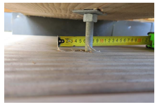
Figure 23: Sliding of the logs measured at the vertical rod

In general, the machined notches in the houses with 200mm logs tended to provide greater resistance to sliding than the hand-hewn notches in the larger logs. More sliding between large logs may also have been due to the greater mass of these buildings.