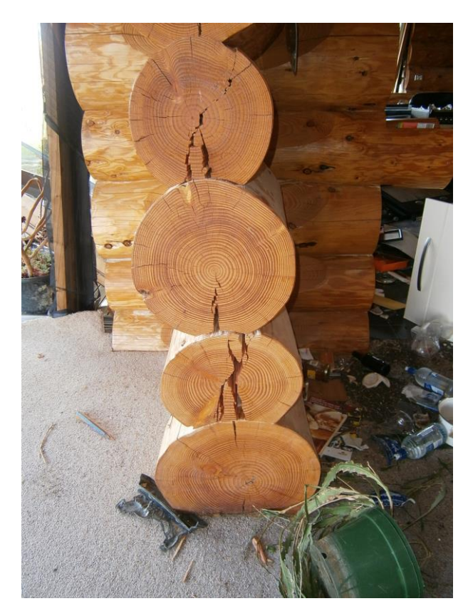
Figure 46: Initiation of splitting in logs, undamaged bottom log