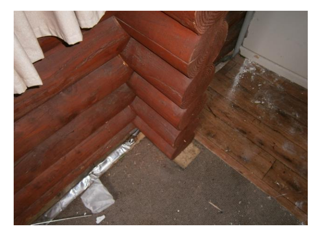
Figure 24: Sliding of the logs on suspended floor