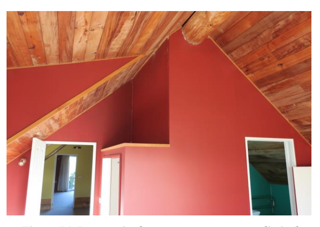
Figure 56: Damage in the upper storey was very limited