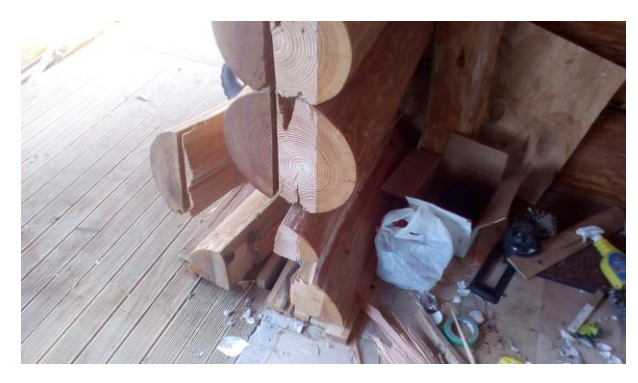
Figure 49: Splitting of bottom log weakened by vertical slot at door frame