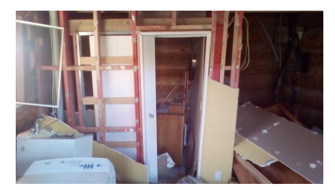
Figure 54: Typical damage to light timber framing walls lined with plasterboard