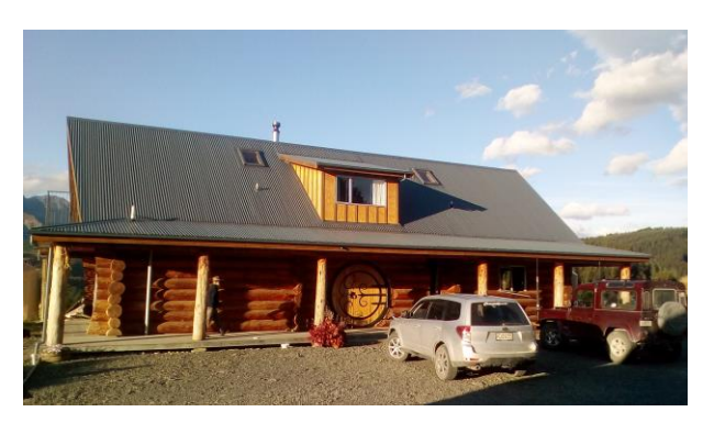
Figure 38: Two storey traditional log house

The authors were directed to one particular log house about half way between Mt Lyford and Waiau, which suffered extreme near-fault shaking, leading to extensive damage. This house is described separately to the others because of the higher level of damage. It is a new house, of large traditional log house construction on a concrete slab, shown in Figures 38 and 39. An indication of the extreme level of local shaking is provided by the rock on the lawn shown in Figure 40, which jumped to a new position over one metre away. The damage to this house is considered to be the result of exceptional ground movement rather than any major deficiencies in the design or construction. Local acceleration amplification due to the local topography, also known as the 'hill crest effect' [9], could have caused the increased shaking of the house.