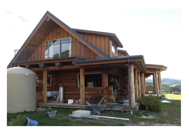
Figure 39: Two storey traditional log house with visible residual drift