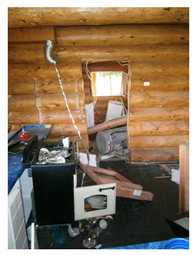
Figure 55: Typical damage from falling or sliding of heavy objects