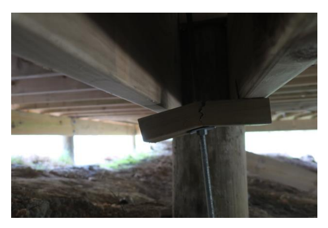
Figure 32: Failure of timber anchorage block