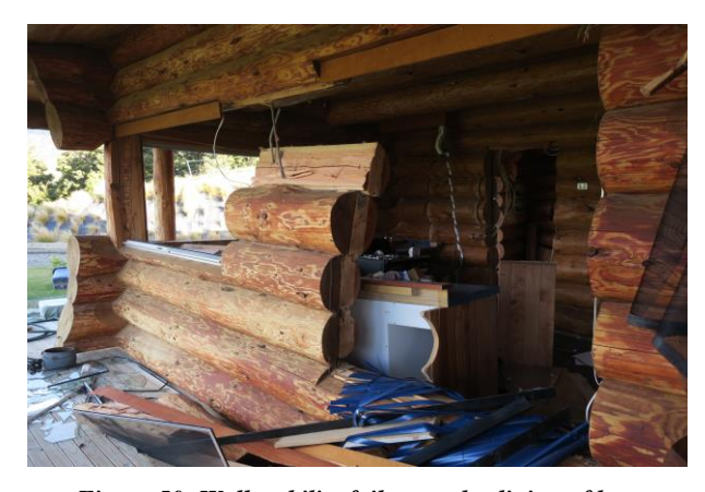
Figure 50: Wall stability failure and splitting of logs