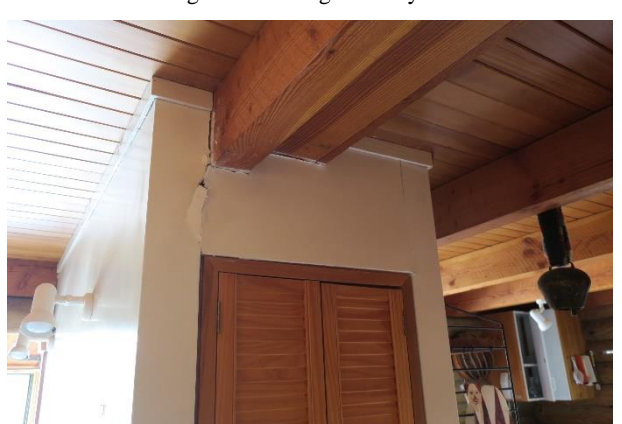
Figure 35: Typical cracking of gypsum plasterboard

In a smaller number of houses there were broken windows or roof damage due to falling chimneys of unreinforced masonry. A few houses had broken windows and there were a small number with damage from falling chimneys.