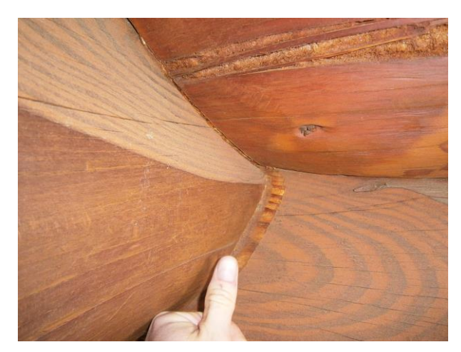
Figure 22: Sliding of the logs at corners

Figure 23 shows 60mm horizontal sliding where the bottom end of the tie-down rod was sitting on the top surface of timber decking.