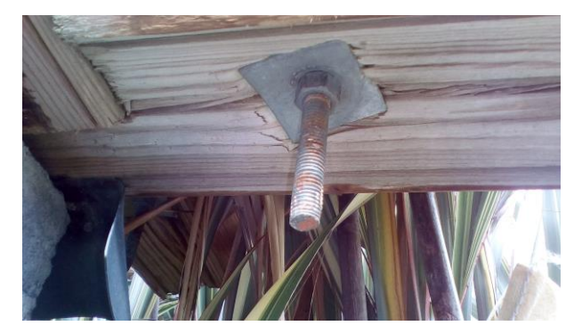
Figure 30: Bent washer and wood crushing in bottom log