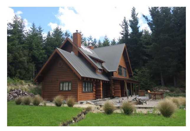
Figure 10: Two storey traditional log house with geotechnical damage