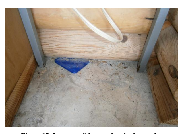
Figure 17: Ice-cream lid trapped under bottom log