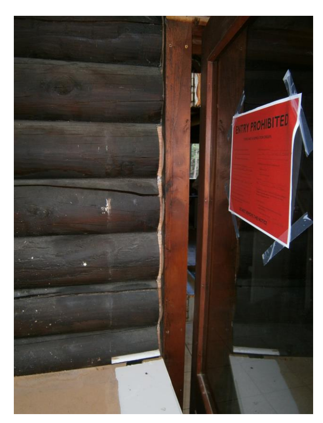
Figure 19: Localized sliding of logs