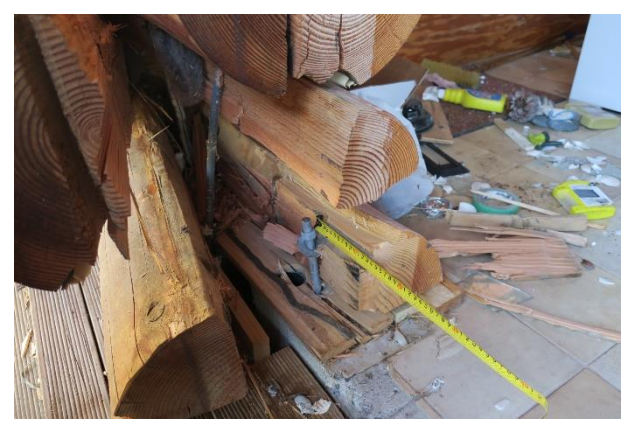
Figure 48: Splitting of logs weakened by tie rods and shear dowels