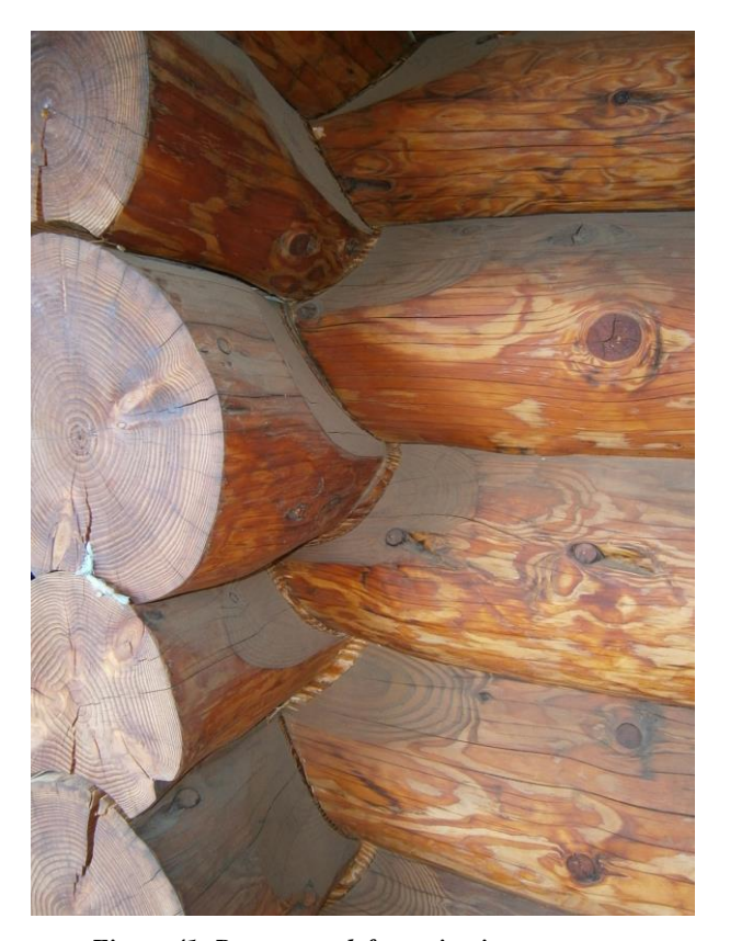
Figure 41: Permanent deformation in corner area