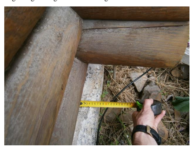
Figure 15: Horizontal sliding of the house

Most houses suffered damage through horizontal sliding between logs, to varying degrees. Sometimes this sliding was concentrated at one or two locations, as shown in Figures 18 and 19. More often the sliding was distributed between many logs as shown in Figures 20 and 21. In either case the sliding resulted in non-structural damage and some permanent distortion. Sliding was sometimes visible at the intersecting corner connections, especially for hand-hewn connections in large irregular logs as shown in Figure 22.