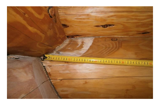
Figure 42: Permanent deformation in corner area