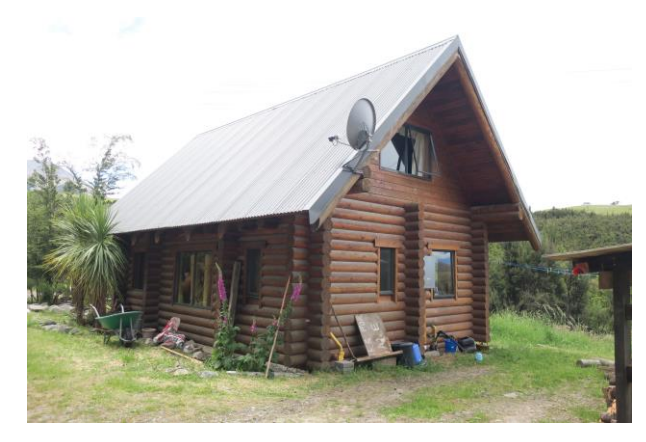
Figure 3: Two storey log house with slab on grade foundation