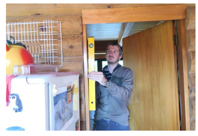
Figure 21: Sliding of logs resulting in residual drifts of the house