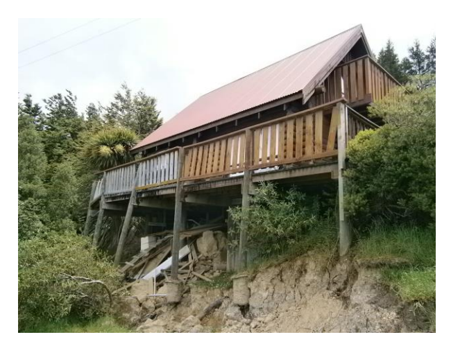
Figure 11: Two storey log house on slope with pole foundation with slope stability failure