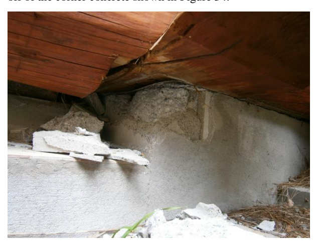
Figure 34: Cracking and spalling of concrete due to large compression forces

Most foundations performed very well, provided that the land remained stable. There were a few exceptions such as cracking off of the corner concrete shown in Figure 34.