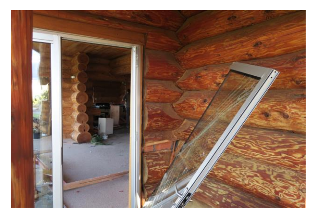
Figure 53: Typical damage to doors and windows due to large horizontal deformation