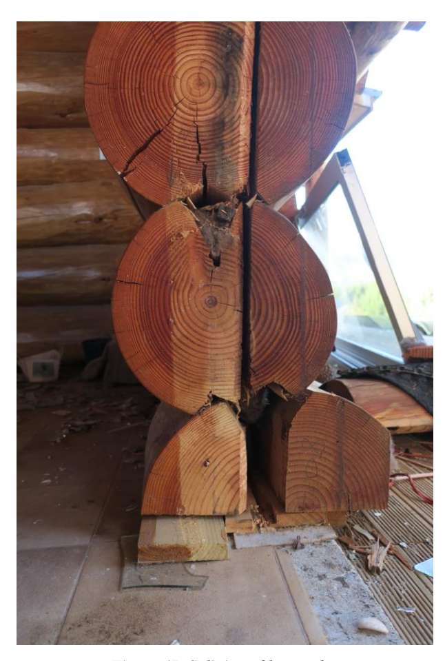
Figure 47: Splitting of bottom log