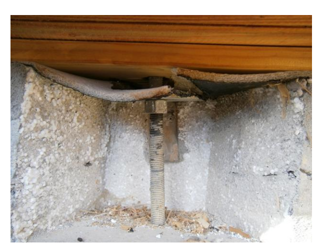
Figure 45: Yielding failure or fracture of tension rod