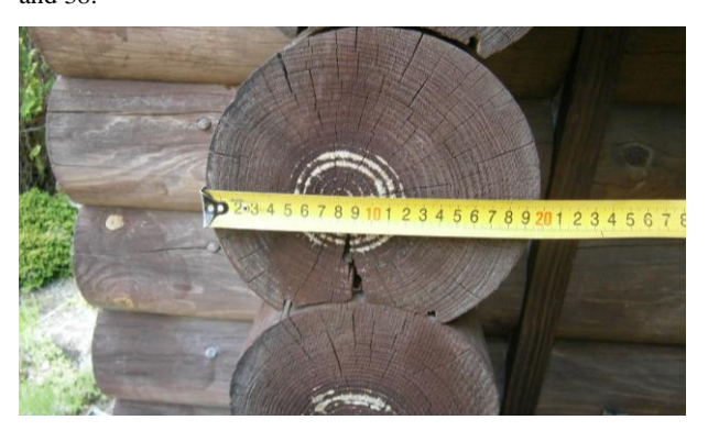
Figure 2: Typical machined logs

A small number of log houses in the Mt Lyford area are built with much larger hand-hewn logs of less regular shapes, in the style of more traditional log houses, as shown in Figures 9, 10 and 38.