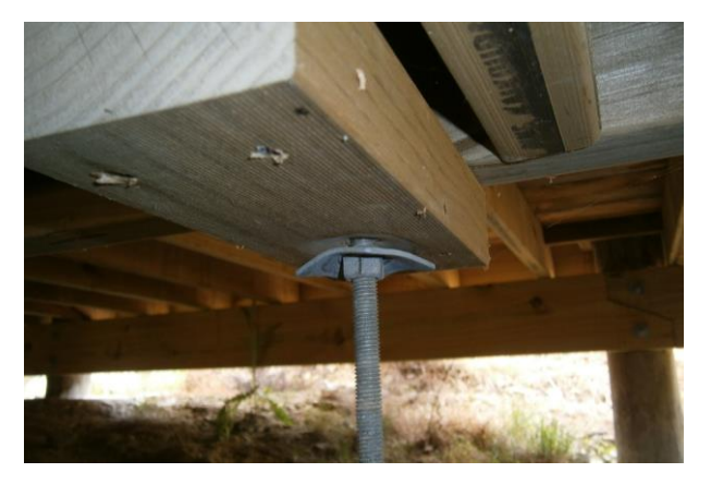
Figure 29: Bent washer and wood crushing in anchorage block