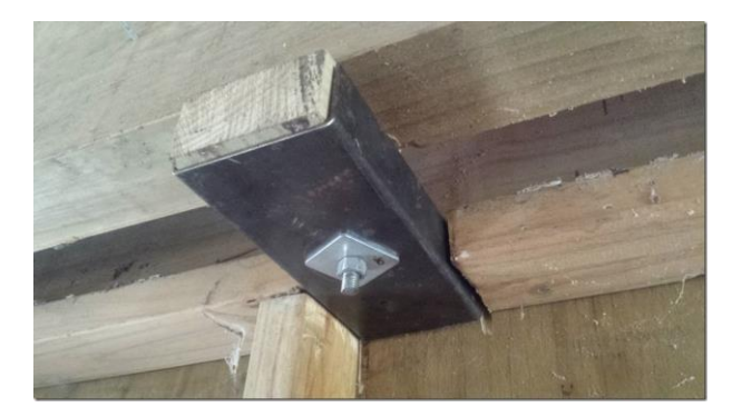
Figure 33: Reinforcement of timber anchorage with a steel profile