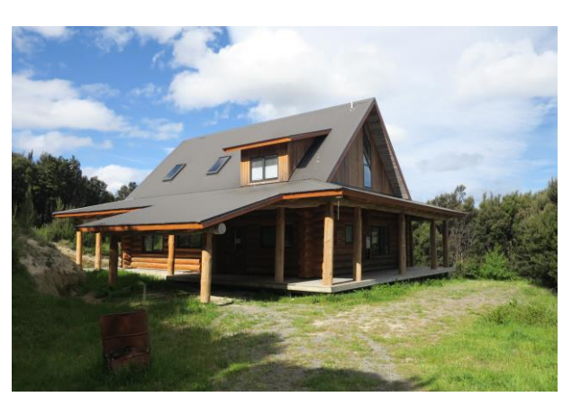
Figure 9: Two storey traditional log house