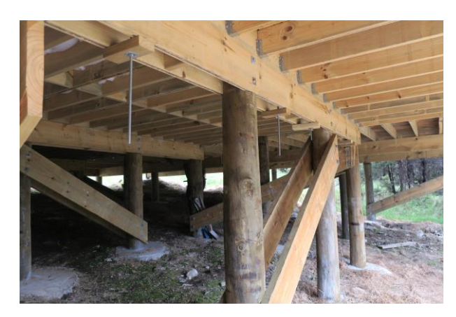
Figure 8: Pole supports with diagonal sub-floor bracing