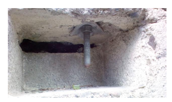
Figure 28: Bent washer in concrete pocket