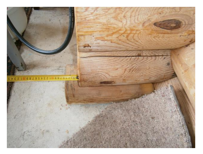
Figure 16: Sliding at the top of the bottom half-log