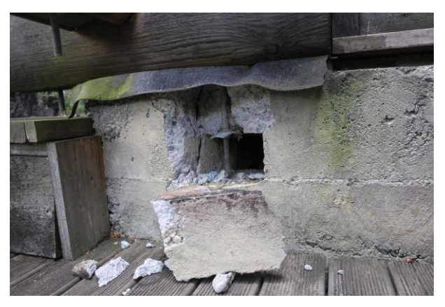
Figure 26: Damage to pocket in concrete foundation due to missing reinforcement

In houses with timber floors, there were some fractures of the short timber anchoring block between double joists as shown in Figure 32. Reinforcement provided by one owner after the earthquake is shown in Figure 33.