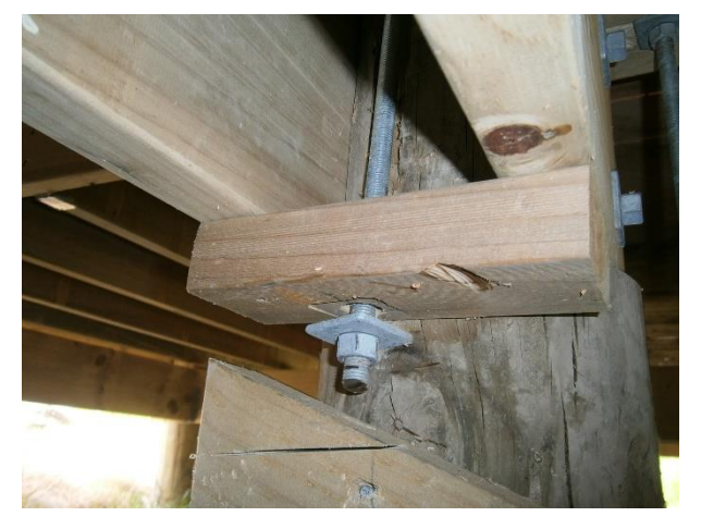
Figure 14: Typical anchorage with a timber block between floor bearers