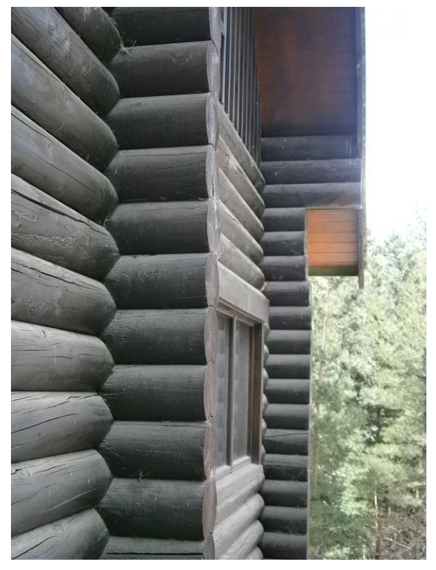
Figure 20: Sliding of logs resulting in residual drifts of the house