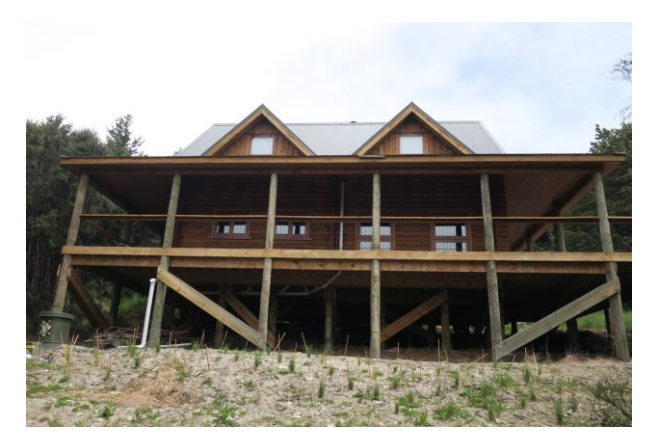
Figure 7: Two storey log house with pole foundation