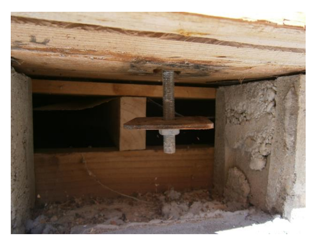
Figure 27: Fractured tie rod