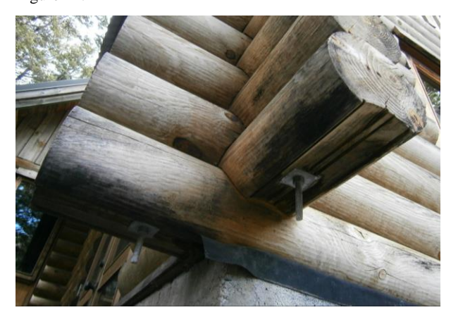
Figure 13: Typical connection with threaded rods through the logs

For houses on raised timber floors, the most typical detail is for the vertical rods to run full height from the top of the top log to the underside of the foundations. The bottom end of the rods is often anchored between double timber bearers as shown in Figure 14.