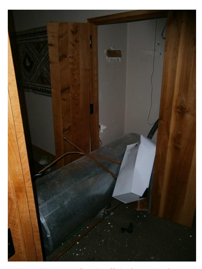
Figure 37: Damage from insufficiently restrained water cylinder