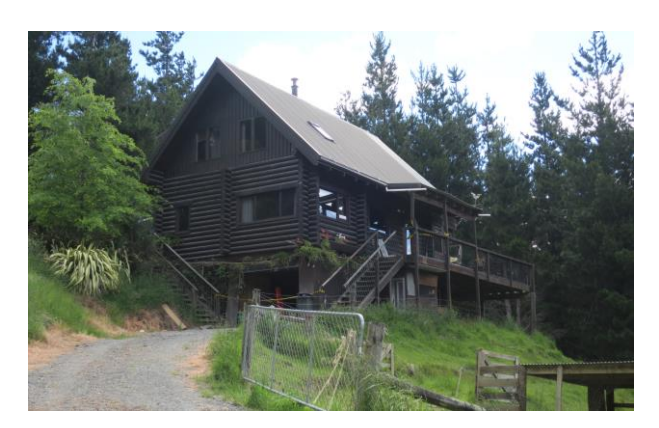
Figure 4: Two storey log house on slope with pole foundation