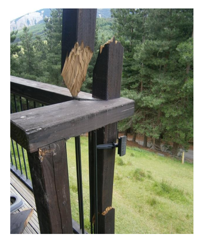
Figure 25: Fracture of veranda post due to excessive lateral movement