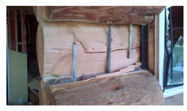
Figure 51: Splitting of log