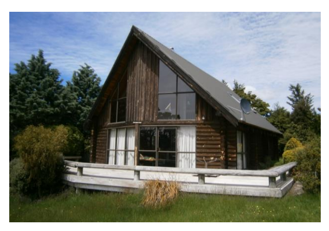
Figure 5: Two storey log house