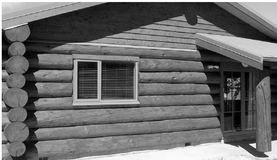
The full log below the window sill log (third layer up from bottom) is lefthand, and so is the log post. Both are good places to use LH trees.

LH trees also shrink more lengthwise than RH trees. Most wood does not shrink much in length—it can shrink quite a bit in diameter (as we all know), but not