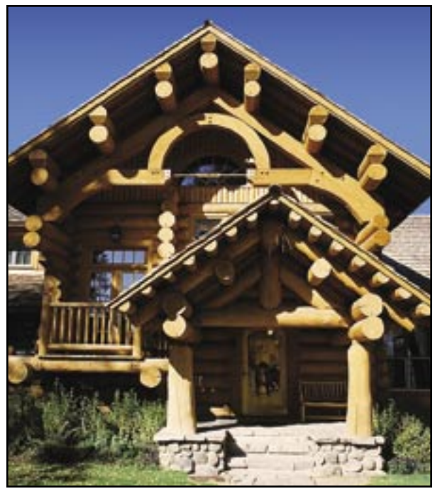
Unique Timber Corp. / EDG Architects