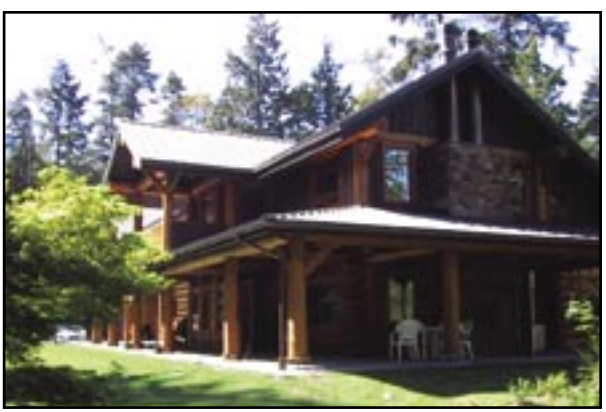
Nicola Logworks Limited / Sortun-VOS Architects