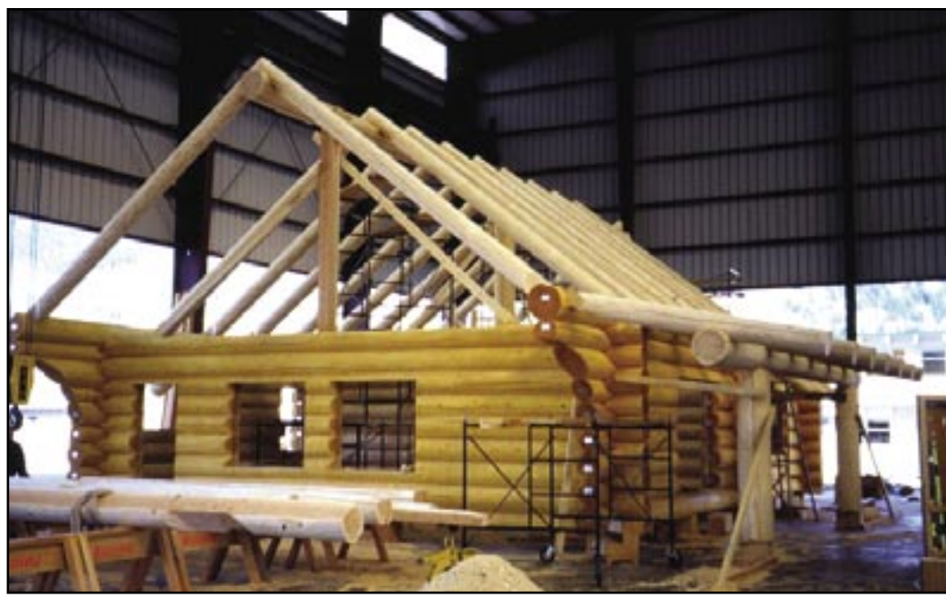
Unique Timber Corp.

If logs in storage are at risk for mold growth, they should be treated with a sapstain control product approved for use on logs - see the section on log treatment. If logs start to discolor from mold, they can be pressure-washed. As the logs dry down during seasoning, they will be less likely to support mold growth.