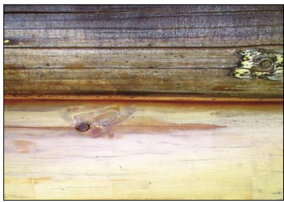
Canadian Building Restoration Products Inc.

Insects that can eat logs or make their homes in wood are of special