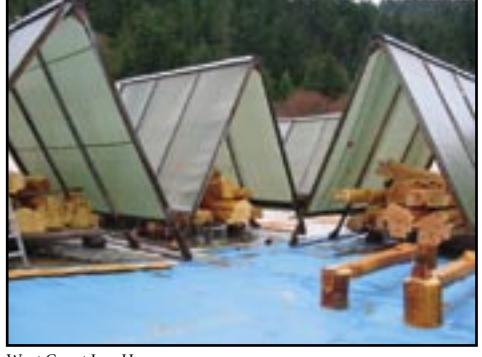
West Coast Log Homes

Many builders prefer to harvest logs in late fall or winter to reduce fungal and insect problems. In the winter, the sapwood has low levels of nutrients (sugars and starches), which would otherwise encourage fungal growth. Also, bark beetles are dormant in winter. Some builders feel that an additional advantage to winter felling is the possibility of less checking, due to a belief that the initial moisture content (MC) of the tree is lower in winter than in summer and there is less difference in MC from heartwood to sapwood. Actually, the tree's MC is lower in the summer due to heavy demand by the needles for water. But this has no relevance, as checking only occurs when parts of the log get below the fiber saturation point (FSP), and the live tree's MC is far above FSP in all seasons. However, one wintertime factor can have a beneficial effect on checking. Slower evaporation in cold winter weather can reduce the drying stresses inside the log, which can reduce checking.