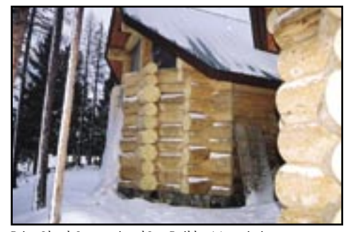
Brian Lloyd, International Log Builders' Association

Some features of this home may cause durability problems, including (not all are visible in the photo): an inadequate roof overhang, lack of base flashing, a non-self-draining roof post/roof beam notch, and poorly-fitted logs.