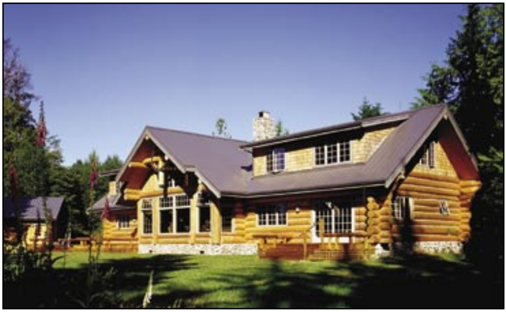
Whitevalley Log Homes/Jean Steinbrecher Architects

A simple wrap-around covered porch provides good wall protection.