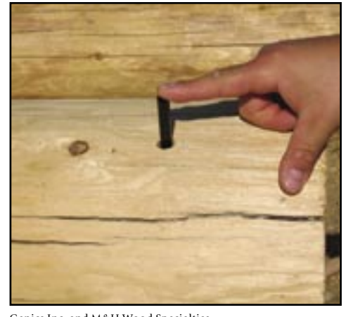
Genics Inc. and M&H Wood Specialties

Also useful for log homes are fused borate rods and borate paste. The rods are inserted into pre-drilled holes in parts of logs that are anticipated to get wet. When the wood reaches adequate moisture content, the rods slowly dissolve and the preservative diffuses through the wet part of the log. Borate rods and borate-glycol mixtures can also be useful for log restoration and