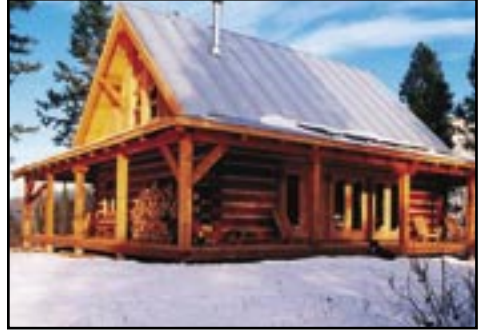
Nicola Logworks Limited/Nicola Logworks Design