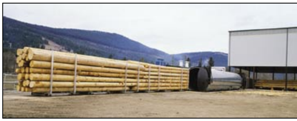
Unique Timber Corp., Brian Lloyd Photography

One manufacturer's approach to safe storage of logs in a wet climate includes protection from rain, ground moisture and ultraviolet exposure.