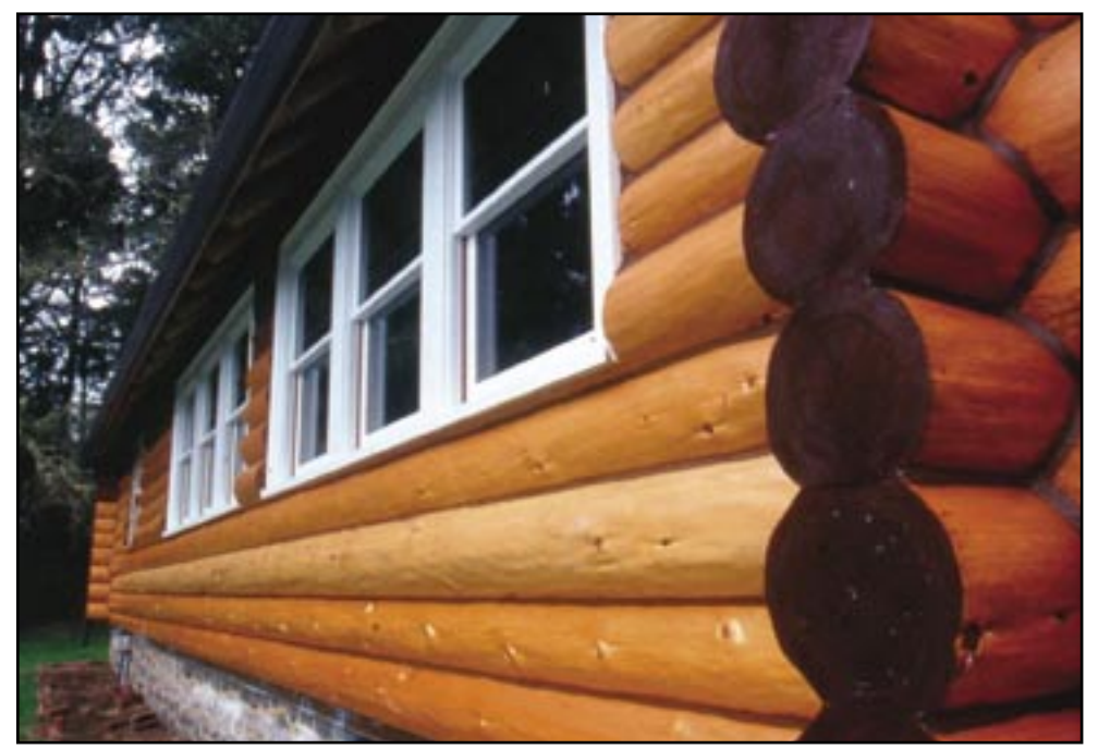
Restoration: David Rogers, Logs & Timbers.

Remember to mask all areas to be protected from finishes, such as windows, doors, shrubs, siding, walkways, etc. This is particularly important when the finish is to be sprayed.